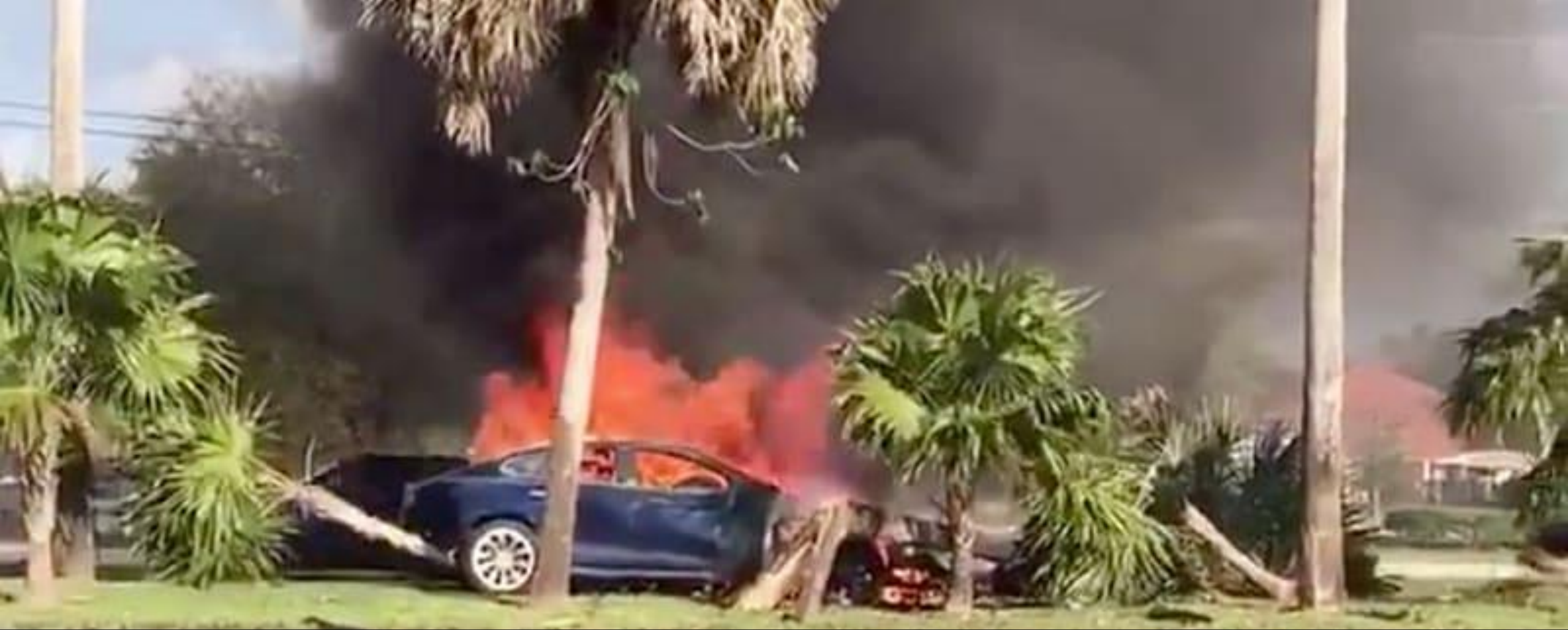
2016 Model S fire South Florida 02-2019