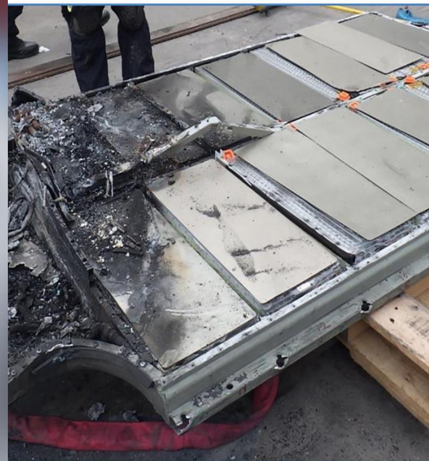
2014 Model S fire Ft. Lauderdale 05-2018