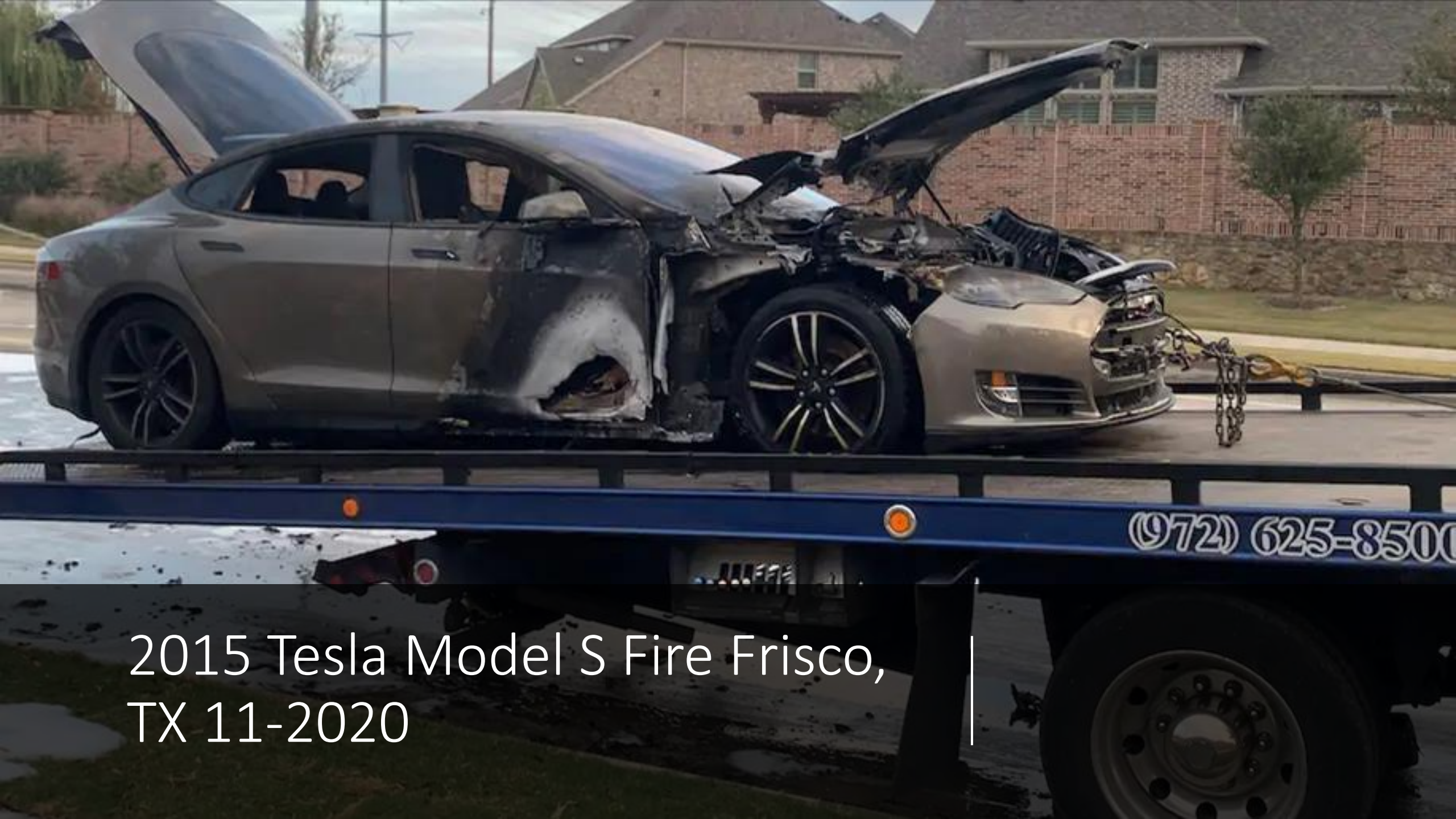
2015 Tesla Model S Fire Frisco, TX 11-2020